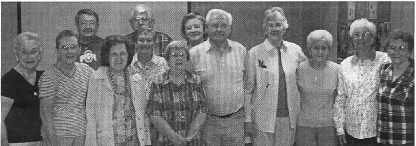
Weatherford, TX: These are some of the Mission Printing workers from the South Main Church of Christ. These dedicated Christians meet at the South Main church building every Thursday morning and work on collating and stapling books that will be sent to souls throughout the world. This is a group that truly is dedicated to "world evangelism by the printed page."

Memorial & Honors February 1, 2010 to April 30, 2010