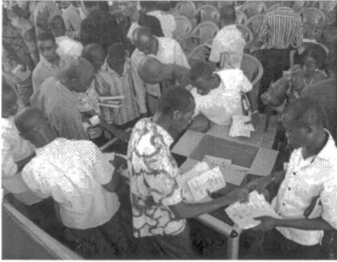
Accra, Ghana Mission Printing tract distribution