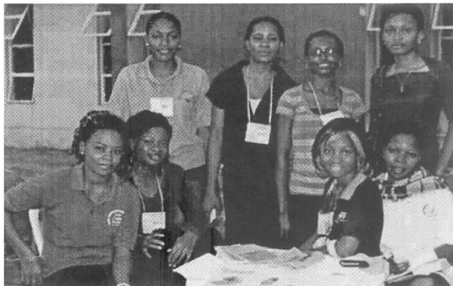
Benin City, Edo State, Nigeria Let the Bible Speak 2010 conference

May God richly bless Mission Printing as you continue in your noble task of "world evangelism by the printed page."