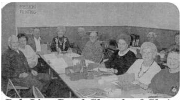
Belt Line Road Church of Christ

"We are bound to thank God always for you The Belt Line Church of Christ is a body of believers brethren, as it is fitting because your faith that teach and follow only the pattern set forth in grows exceedingly, and the love of every one God's word. They are never willing to compromise of you all abounds toward each other, so that or settle for anything less than what God has set we ourselves boast of you among the churches forward. This Christ-centered congregation knows that the word of God is the only guide by which of God for your patience and faith ...." II Thessalonians 1:3-4a someone finds salvation and the eternal home in