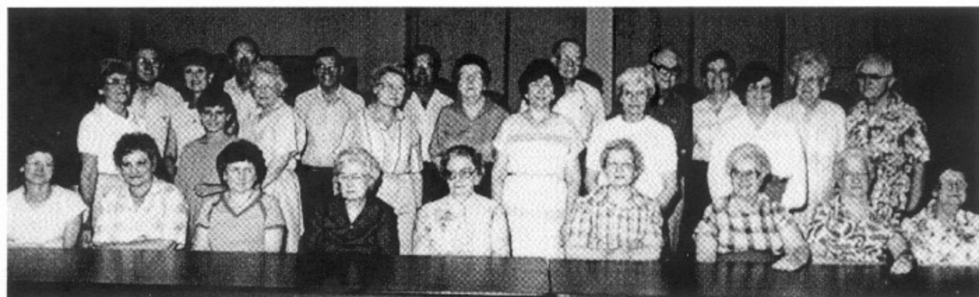
1985 picture-Mission Printing workers (starting w/ bottom left):