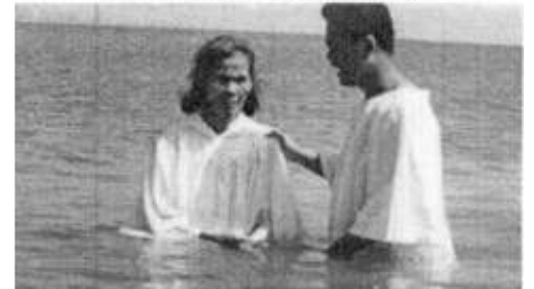
picture below: Brother Indong baptizing woman after lengthy study of God's word